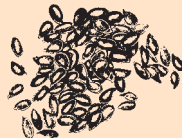
British Grown Linseed