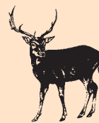
Red & Fallow Venison