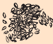
British Grown Linseed